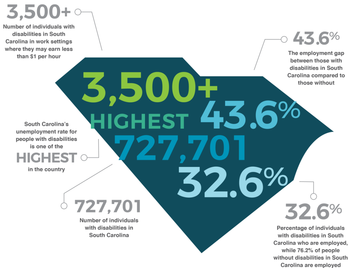
Figure 1. Infographic of disability employment related statistics.

the high unemployment rate for citizens with disabilities, South Carolina also has an estimated 3,513 citizens with disabilities in sheltered workshops where they may earn less than minimum wage via section 14c of the Fair Labor Standards Act which passed in 1938. This law allows employers to pay certain employees less than minimum wage based on the perceived impact the employee's disability has on his or her ability to perform the job (CRP List, 2018). Although federal law and several states, including South Carolina, allow employees to pay lower wages to citizens with disabilities, a few states have passed legislation to eliminate subminimum wage.